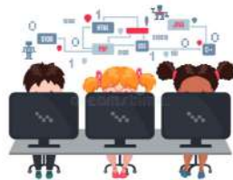
E-Safety and Programming