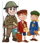
World War Two