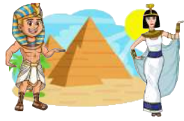
The Ancient Egyptians