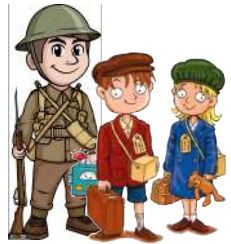
World War Two