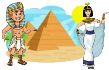
The Ancient Egyptians