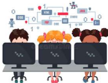
E-Safety and Programming