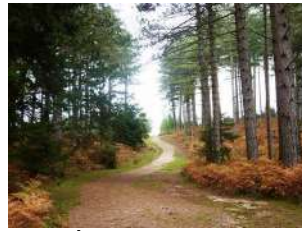
The New Forest